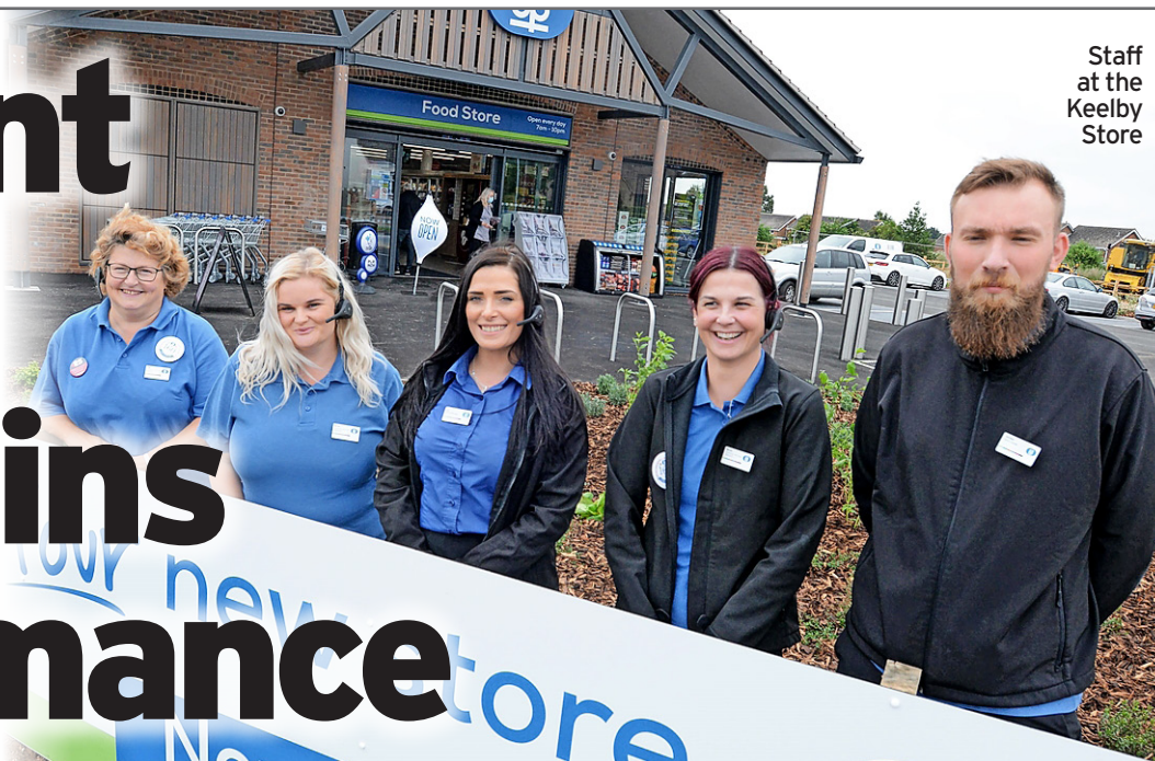
Staff at the Keelby Store

The Society's Community Champions fundraising scheme raised £648,684 for 586 local charities and community groups, including for defibrillators and first responder charities.