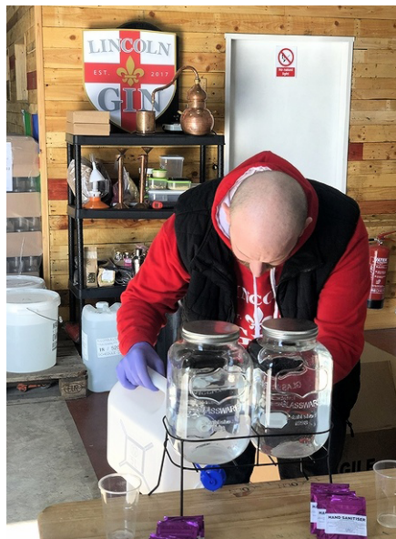
Lincoln Gin have donated hand sanitisers during lockdown