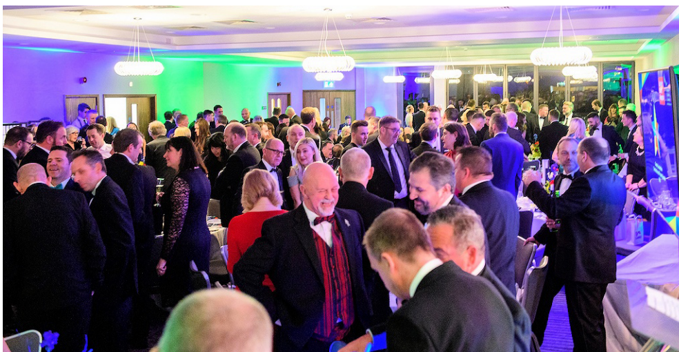
The Greater Lincolnshire Construction and Property Awards 2020, organised by the Lincolnshire Chamber of Commerce, held at The DoubleTree by Hilton, Lincoln.

For up-to-date information on the awards please visit www.lincsconstructionandpropertyawards.co.uk