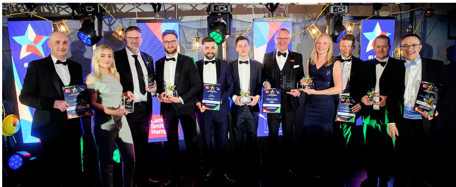
The Greater Lincolnshire Construction and Property Awards 2020 winners.

"We are confident that we can implement social distancing guidance, whilst still delivering a great event and we would love for you all to be a part of the awards again in