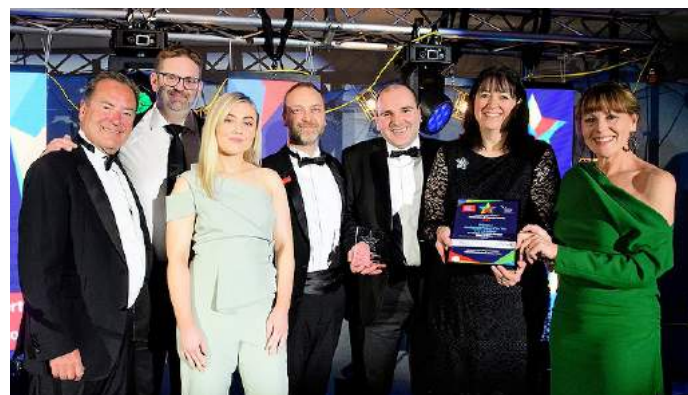
Development Project of the Year (over £5million), sponsored by Cartwright Communications. Winner: Lincolnshire Blue Light Campus