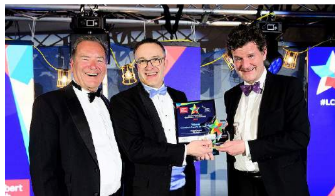
Innovation in Property and Construction, sponsored by Chattertons Solicitors. Winner: Project Compass – EV Camel