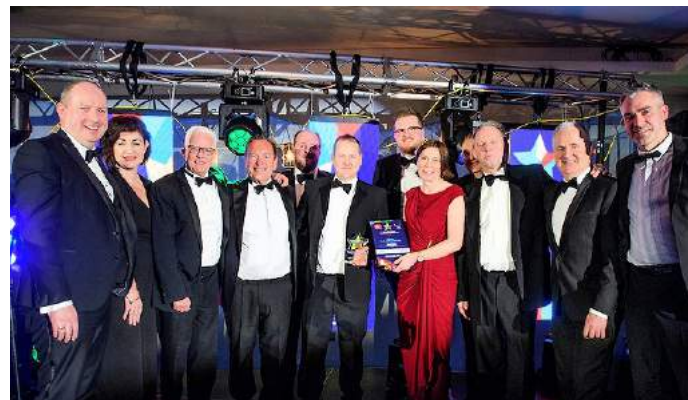
Residential Project of the Year, sponsored by Rizk McCay. Winner: Nomad Centre – YMCA Lincolnshire