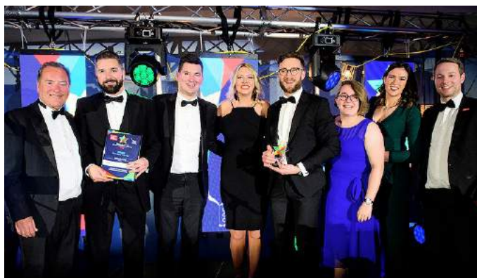
Consultancy of the Year, sponsored by Delta Simons. Winner: Waldeck Consulting