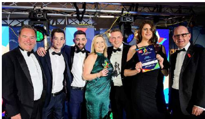
Agent of the Year, sponsored by Willmott Dixon. Winner: Pygott & Crone

Make sure you keep up to date with us at www.lincs-chamber.co.uk Until next time.