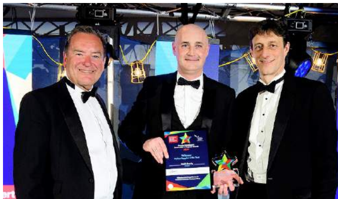
Product Supplier of the Year, sponsored by Wilkin Chapman. Winner: Lincoln Security