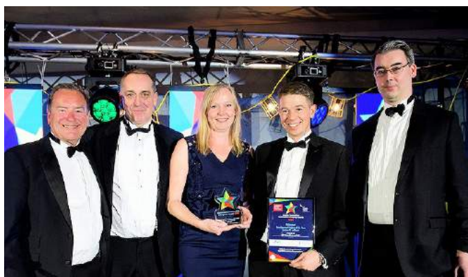
Development Project of the Year (up to £5million), sponsored by Roythornes Solicitors. Winner: Altitude44