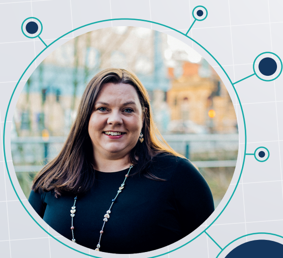
Educational Partnerships Development Manager, University of Lincoln

STEM Consultant, Founder of Propulsion Coaching, TEDX Speaker