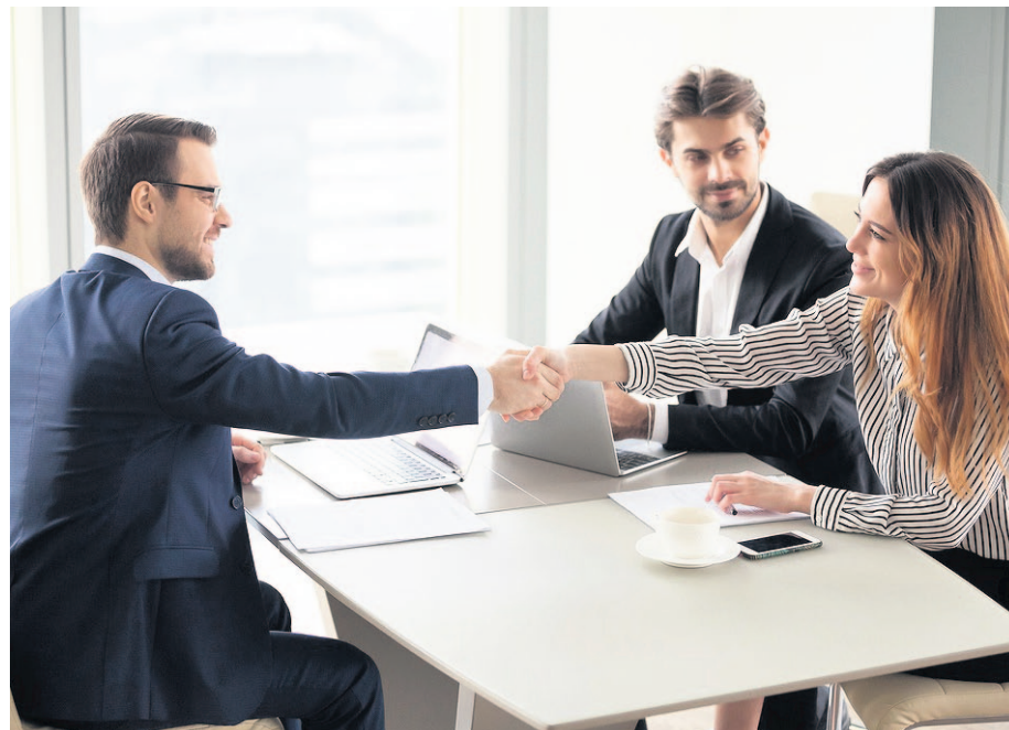
HR consultants will be able to pin down issues your company might be experiencing with recruitment

Simply by joining relevant platforms you can increase your brand awareness. The more you like, comment, share and follow others, the more you are likely to see a return. Make sure to create social media