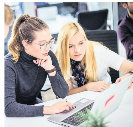
Enhance the power of social media and newspaper advertising

For instance, if you are a construction business, you probably do not want to reshare posts from a dog groomer as this is not relevant to what you have to offer! Think quality, not quantity.