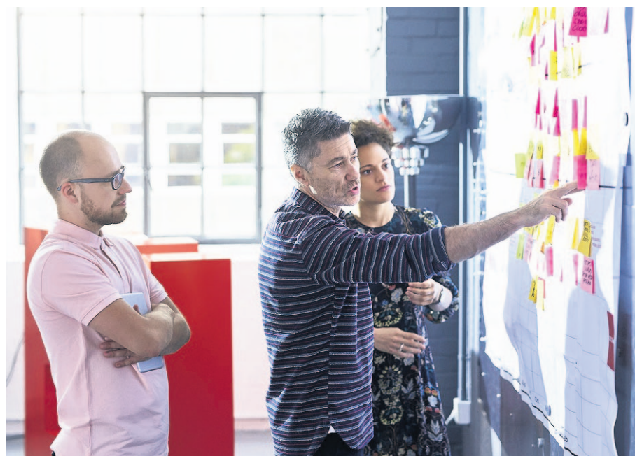
It's important to plan your strategy for the year ahead

Whatever your business goals might be for 2020, we are here to help you thrive. Get in touch to find out more about what the Lincolnshire Chamber of Commerce can do for you this year.