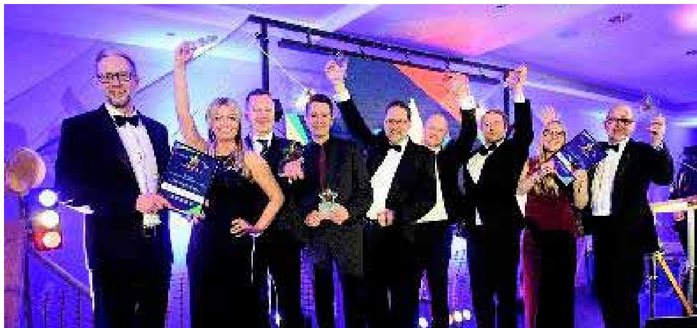
2019 winners of the Greater Lincolnshire Construction and Property Awards