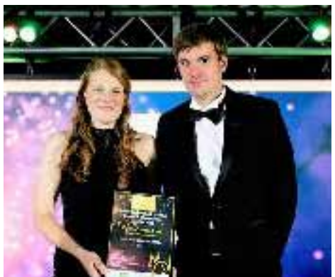
Highly Commended: Wholesaler of the Year - Lymn Bank Farm Cheese Co