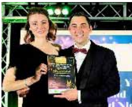
Highly commended: Producer/Grower of the Year - Bottomley Distillers