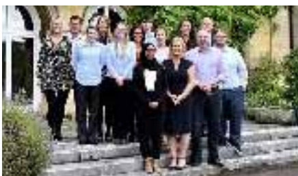
The Wellingore team

Newark and Peterborough offices will see our multi-disciplinary teams working closely to deliver work for clients across East Midlands. We see the region as a core part of our strategy and this office is a commitment to the local area, our clients and employees."