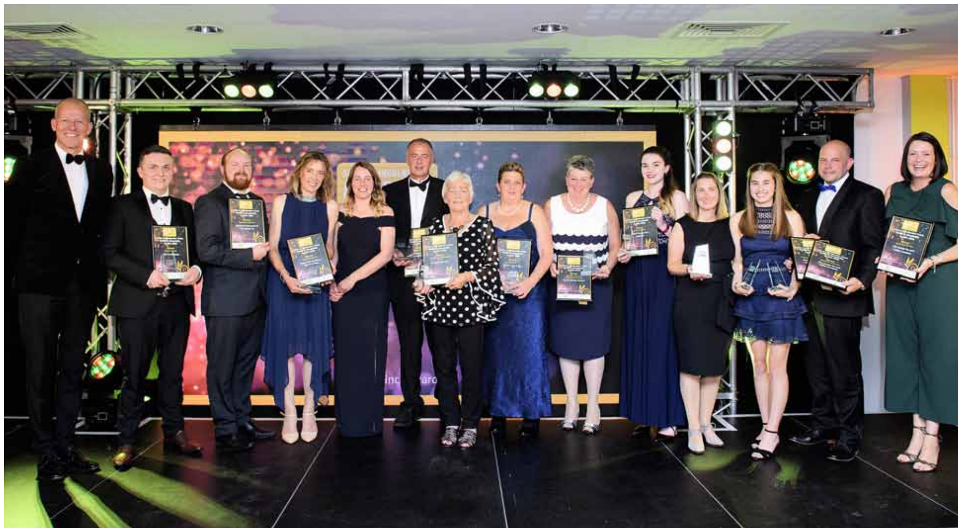
The 2019 Select Lincolnshire Award winners