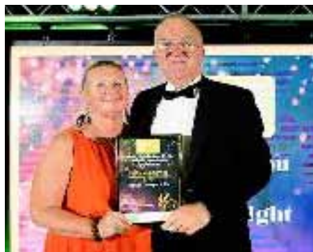
Highly Commended: Self Catering Establishment of the Year - Treetops Cottages & Spa