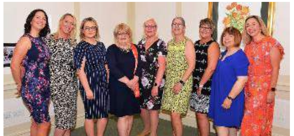
BWLs focus members and guest speaker at its Summer Luncheon

More than 75 women turned-out for Business Women's Link's Summer Lunch – and served-up a fantastic £500-plus boost for charity!