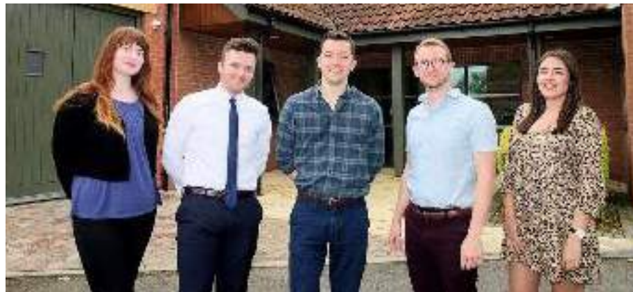
The Carrington team

Digital PR and marketing agency Carrington has moved onto an exciting new stage of expansion as it leaves 'incubation' and moves into a new, larger premises.