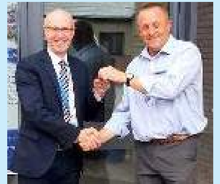
Keys were officially handed over from contractors Lindum Construction